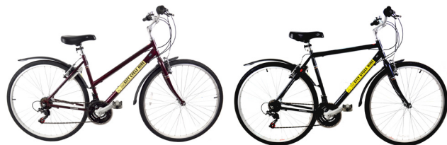
Urban Student Bikes - Budget option

We carry out repairs and servicing like other shops as we are not only a rental service. If you have your own bike, we are here to help and happy to check your bike for problems.