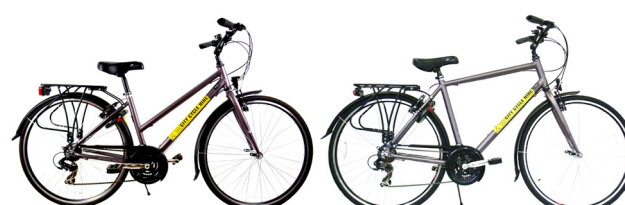
City Trekking Bikes - Leisure +Professional

5 SIZES AVAILABLE LOCK, LIGHTS AND BASKET FREE REPAIR AND MAINTENANCE